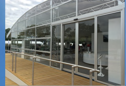
Other bespoke access options