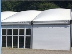
PVC inflated thermo roofs