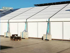
Cost effective & weatherproof