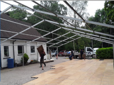
Solid base - cost effective