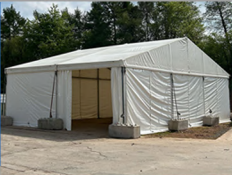
Cost effective & weatherproof