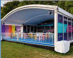
Hospitality & retail