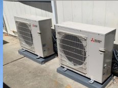
Heating, cooling and ventilation