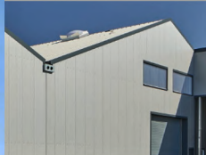
Fully insulated roofs