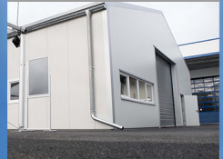
Fully insulated walls