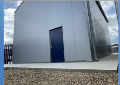
Pre build ground works