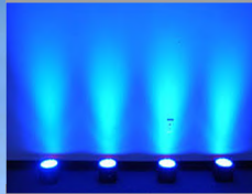
Bespoke decorative lighting