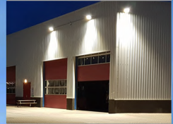
Flood lights and more