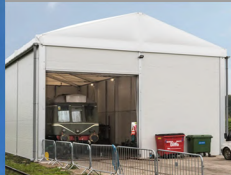
Semi insulated & durable