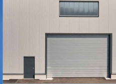
Multiple roller shutter door options