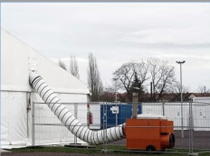
Range of heating systems