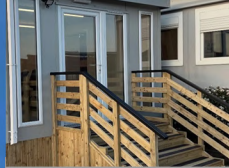
Ramps, stairways and handrails