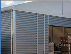
Range of strong & durable walls