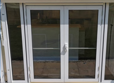
Range of sizes and designs