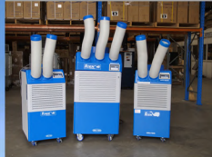
Range of air conditioning