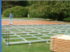
Levelled steel subframe floor