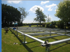
Suspended sturdy and levelled