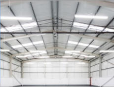
Functional and practical