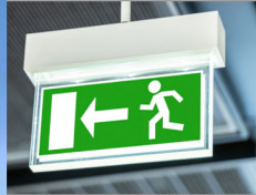
Range of safety lighting options